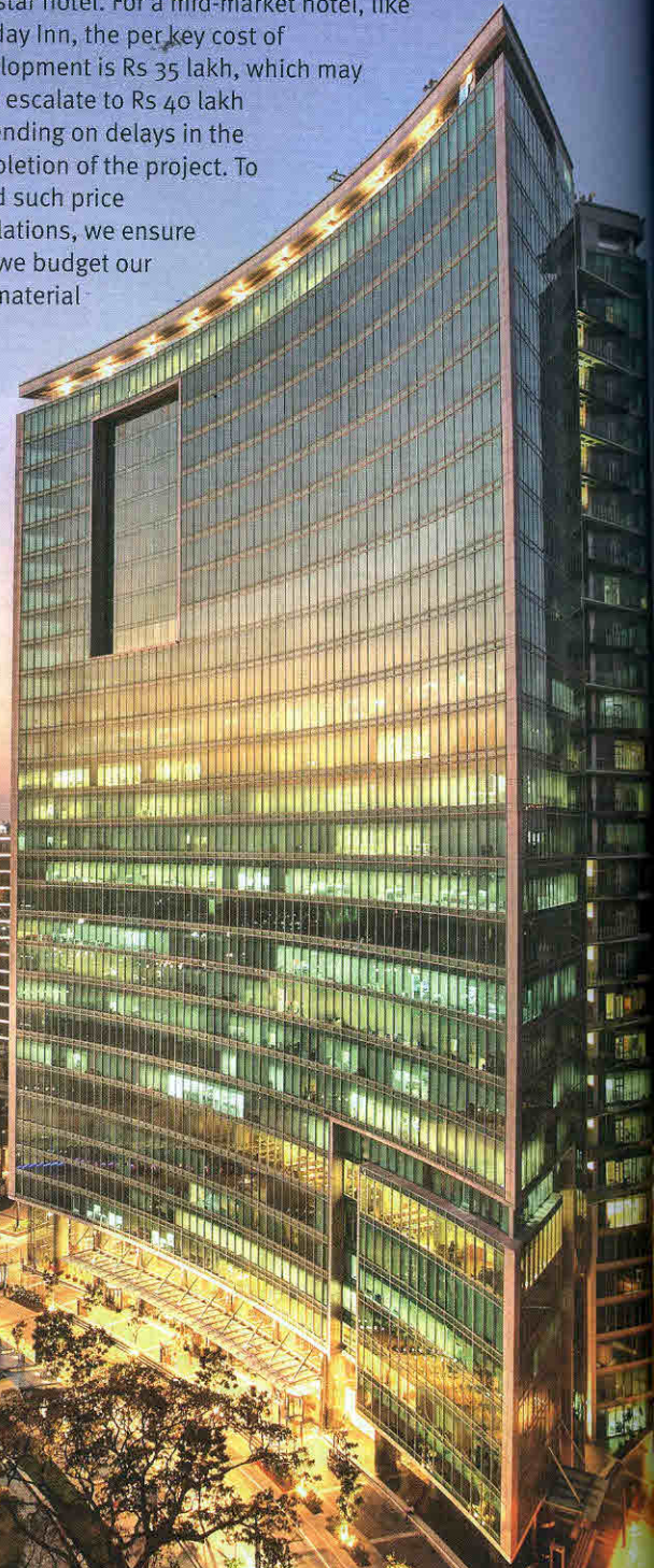
BHSL has invested about Rs 400 crore in the hospitality sector, which also includes clubs and a convention centre.

Our hotels have been doing very well! Grand Mercure has had an occupancy rate of 85 per cent in February and March, as against the city’s average of 58 per cent. Our room rates are also higher than the city’s average – Rs 8,500 as against Rs 6,500. Besides, as a developer we try to limit our per key cost of development for a five-star hotel to