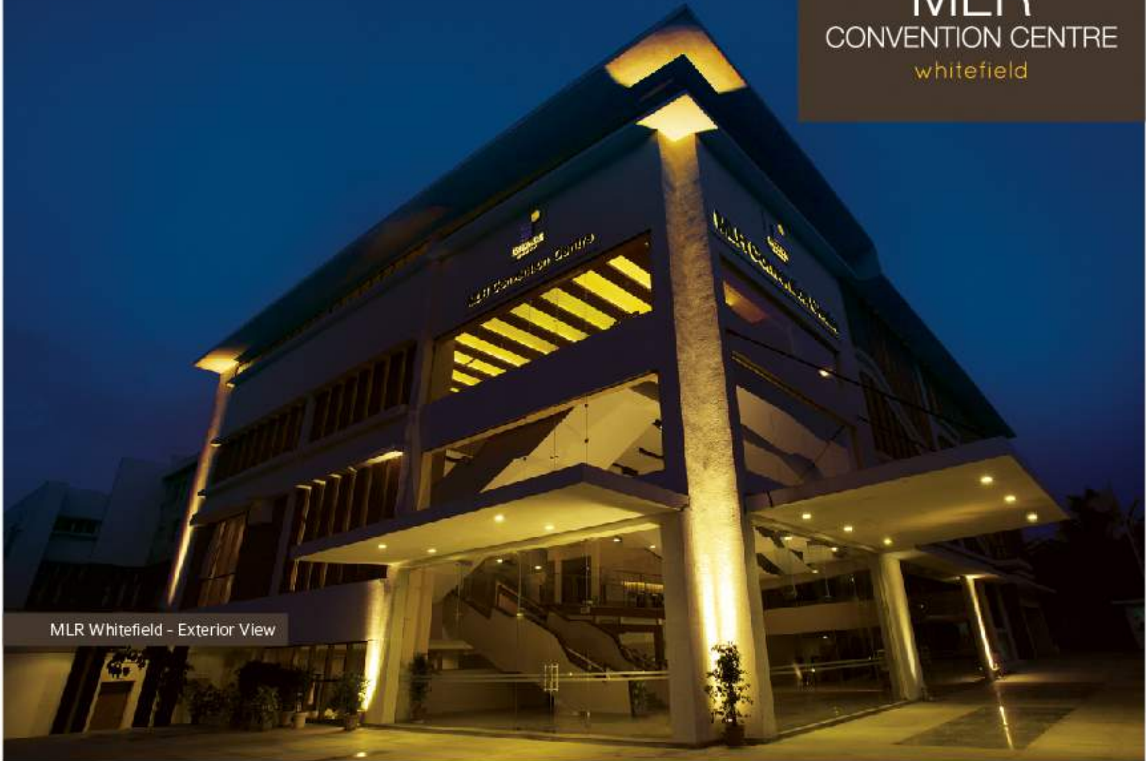
MLR Whitefield - Exterior View