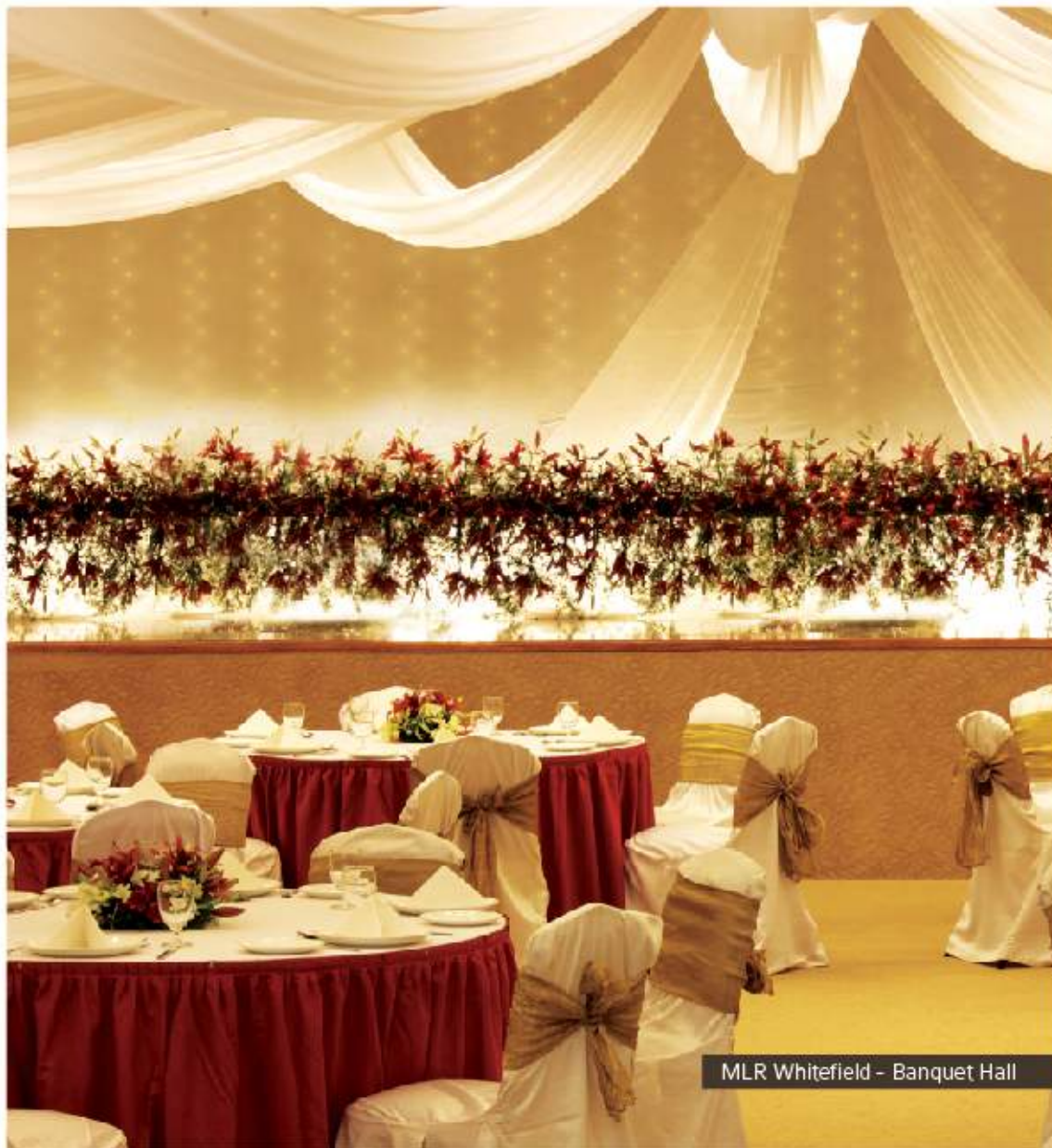
MLR Whitefield - Banquet Hall