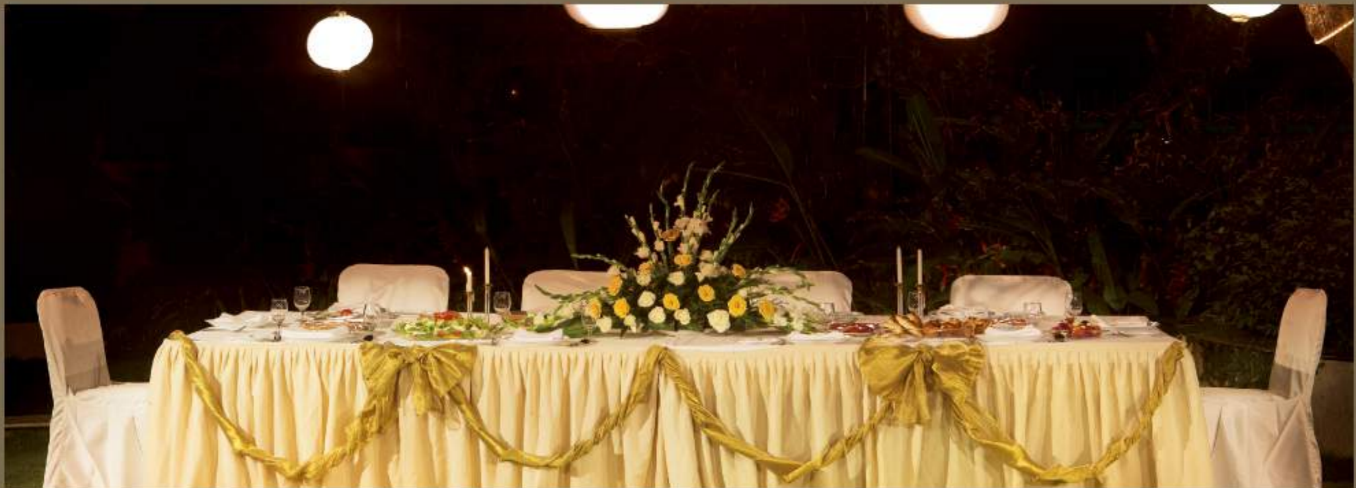
An outdoor setting at the Augusta Club