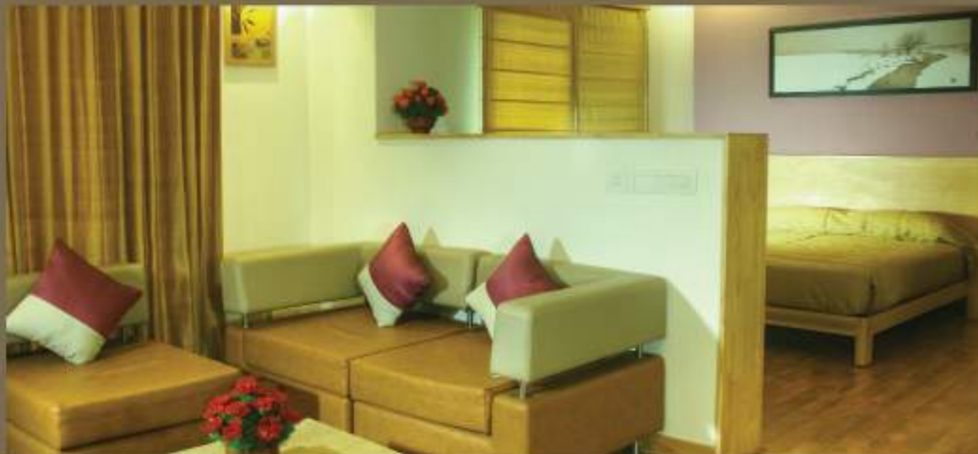
Brigade Homestead - Jayanagar