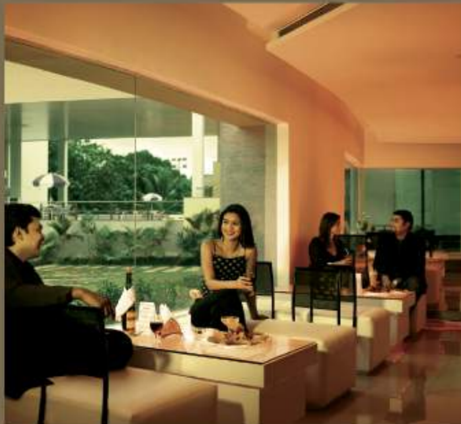
Tonic Bar at the Woodrose Club

The clubs provide their members a venue for complete relaxation and rejuvenation; with superlative sporting facilities, restaurants, health and beauty facilities and a number of banqueting and conferencing options. All clubs are up and running and open to memberships - strictly by invitation.