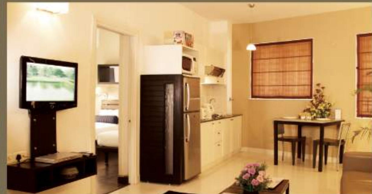
Brigade Homestead - Lavelle Road