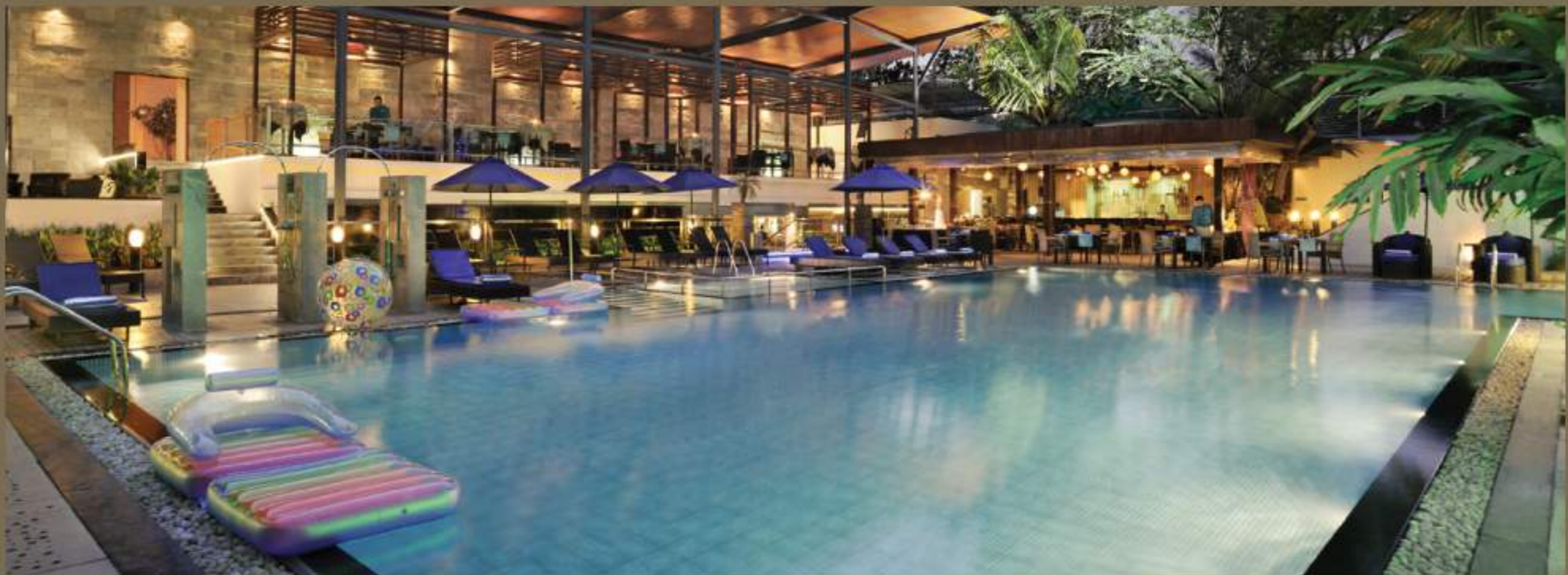
The Pool at Grand Mercure, Bangalore