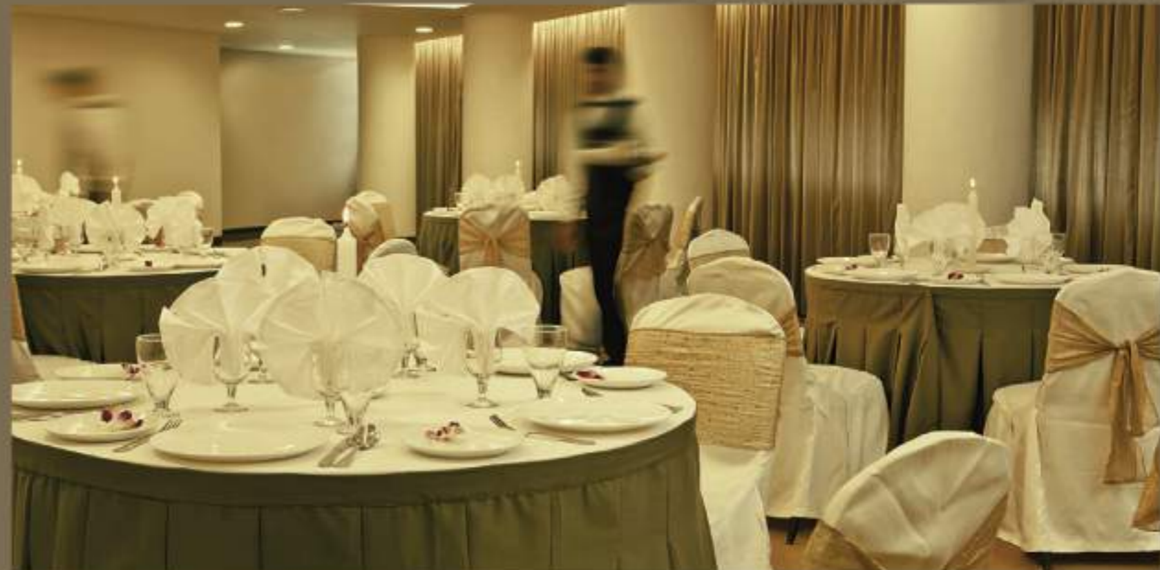
Banquet Hall at the Galaxy Club