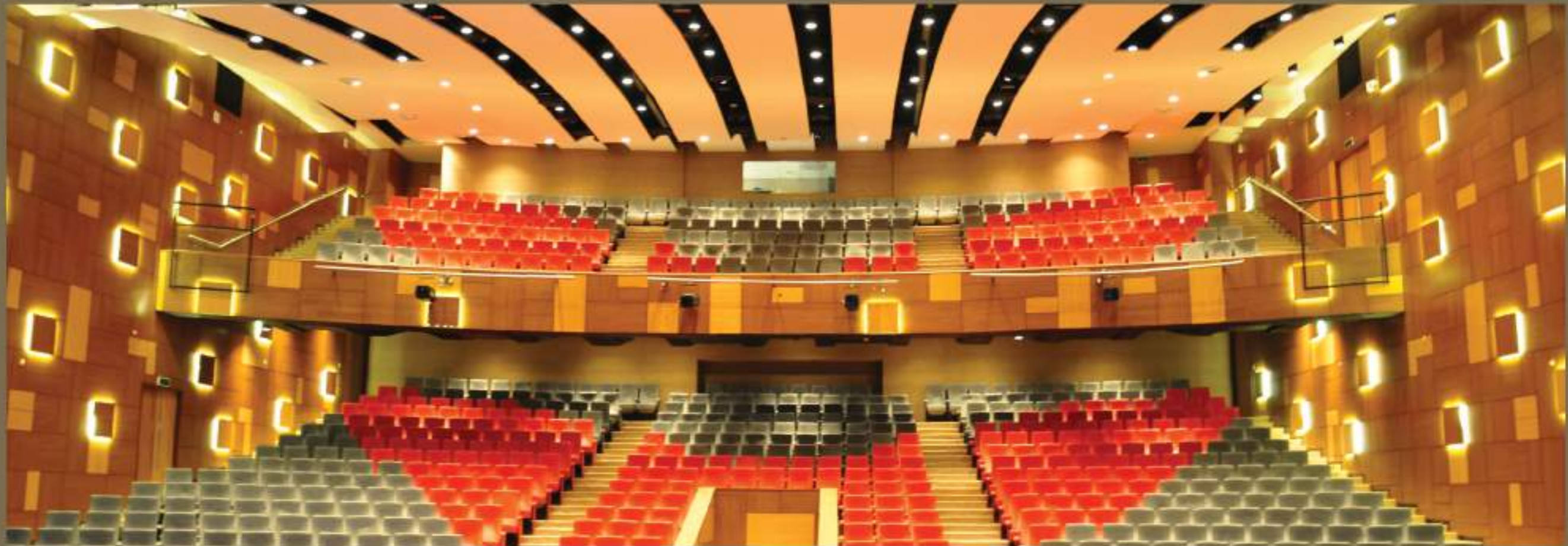
The Auditorium at MLR Convention Center, Whitefield