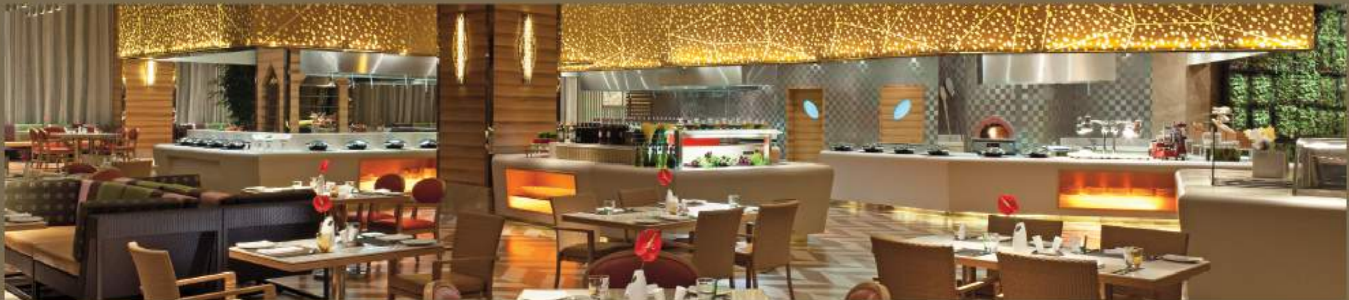
'Feast'; the all day dining restaurant at the Sheraton Bangalore Hotel at Brigade Gateway