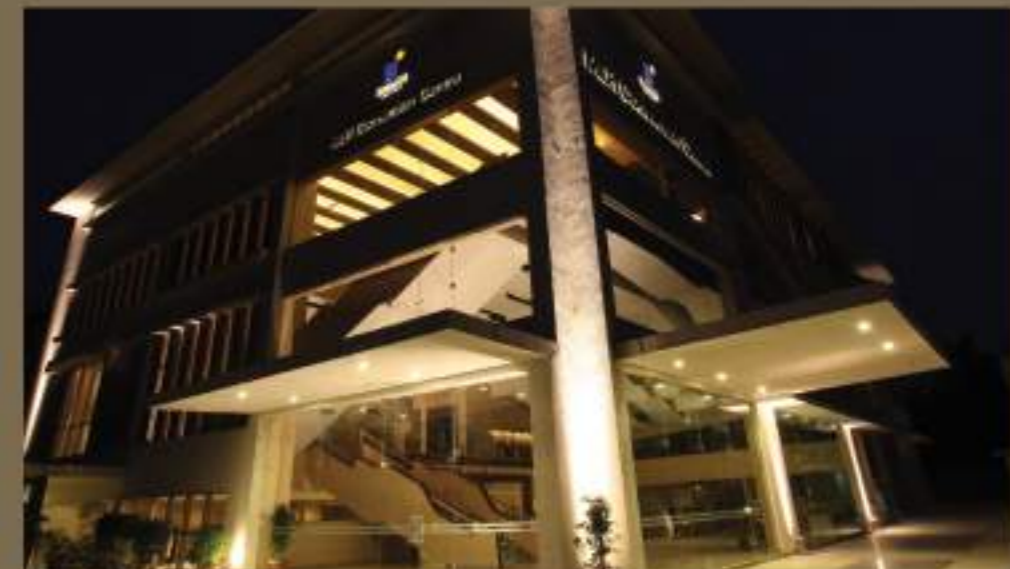
Views of MLR Convention Centres at J.P. Nagar & Whitefield