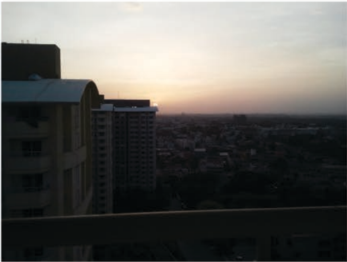
B The Evening Sun