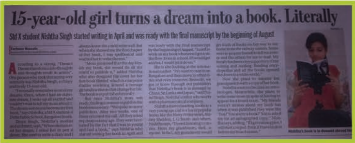
Article in Bangalore Mirror