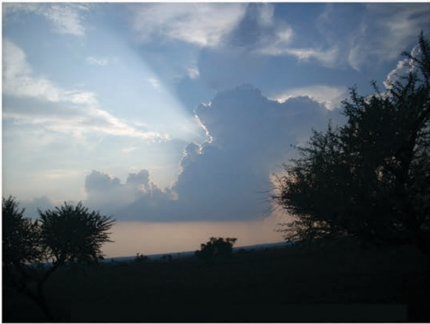
C Light and Shade on a journey from Hampi to Bijapur

Life is a series of moments experienced and captured in many ways. But there are some moments that are extra special, which we will treasure always! If you have captured the true essence of any such moment through a photograph and you would like to share it, please send in your contributions to Email: brigadebeat@brigadehospitality.com The best will be featured in the next edition of Brigade Beat.