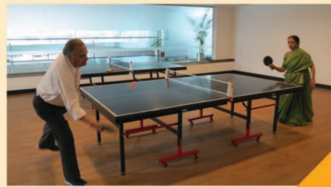
Galaxy club hosted an event exclusively for senior citizens, as part of an initiative by Nightingales Medical Trust.