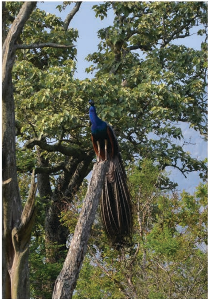
D Peafowl at Mudhumalai Wild life Sanctuary

Life is a series of moments experienced and captured in many ways. But there are some moments that are extra special, which we will treasure always! If you have captured the true essence of any such moment through a photograph and you would like to share it, please send in your contributions to Email: brigadebeat@brigadehospitality.com The best will be featured in the next edition of Brigade Beat.