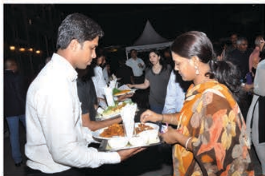
Orion Mall Launch