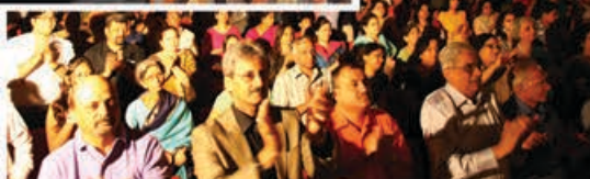
Dakshin 2012 The Brigade Group Fest - Catering