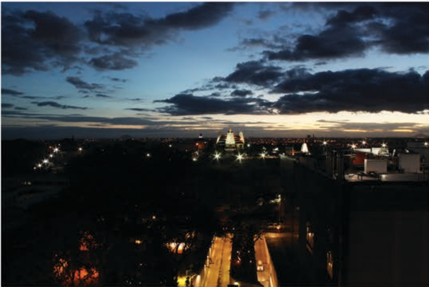
A ISKON Temple with a view of the City and the Sky at night